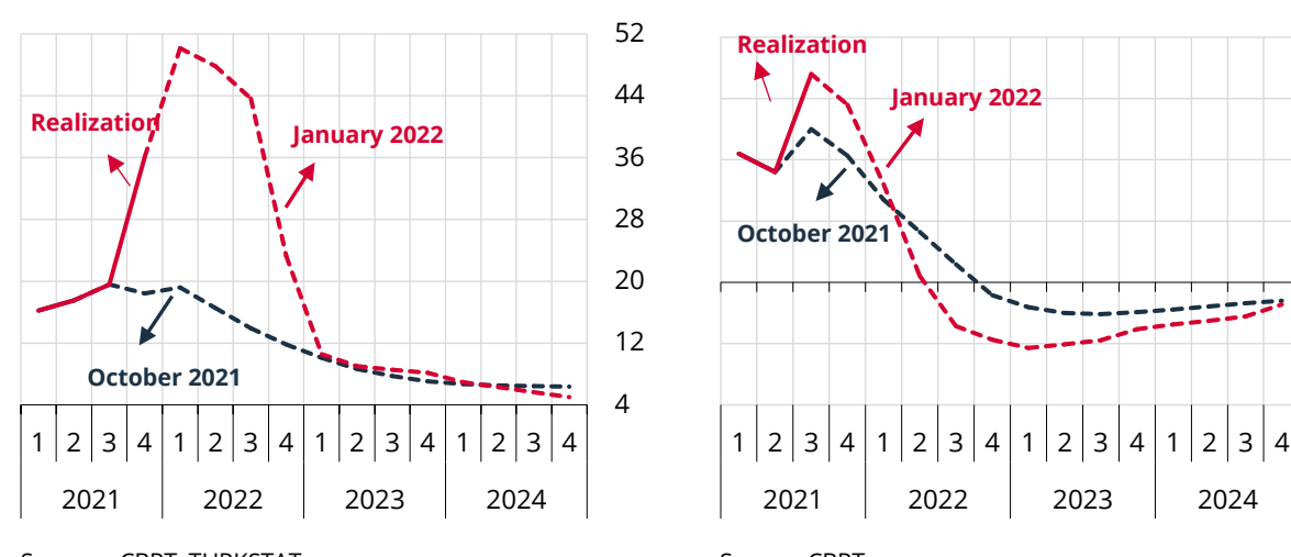
Chart 3.2.3: Output Gap Forecast (%)