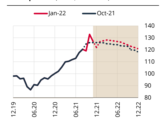
Chart 3.1.2: Revisions to Import Price Assumptions* (Index, 2015=100)