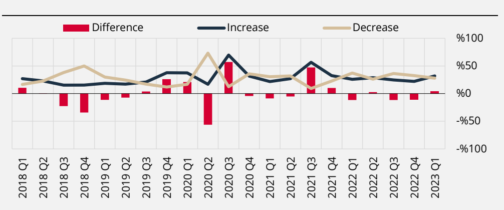
Chart 1: Demand Perception of Firms* (Compared to the Previous Quarter)

On a sectoral basis, the rebound in foreign demand in the European textile sector started to be mirrored in export orders, and apparel exports remained strong compared to the previous quarter. In furniture exports, it was stated that despite the cost disadvantage caused by the lower freight prices, product quality and delivery speed advantage of the Turkish firms in the US and European markets continued. In the white goods main and sub-industry, it was emphasized that the negative impact of the recession in Europe on sales remained limited, thereby leading to a sustained steady course. While it was disclosed that exports in the automotive sector maintained a positive outlook, it was pointed out that producer companies in the basic metal industry might shift to the domestic market amid the growing demand mainly for construction steel after the earthquake. It was stated that the course of the tourism sector hovered around normal seasonal levels, and although there were short-term cancellations due to the earthquake in February, the demand was not negatively affected for most of the quarter. It was also expressed that the booking data indicate that the European demand is strong.